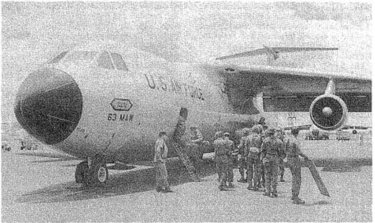
Homeward bound after a tour in Vietnam.