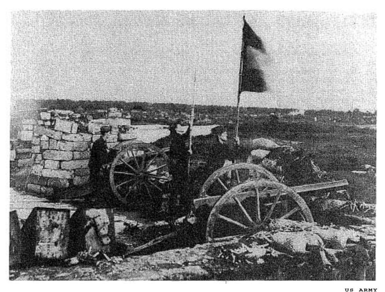
U.S. infantry in the Philippines participated in a popular "war for empire" which lost support of American citizens when it became a prolonged suppression of Philippine insurrectionists.

institutions), but also China, a society that has contributed so much to civilization. Similarly, attention should be given to a study of the cultural-military ancestry of those operate under the which nations socio-political system of Islam. Finally, the impact of the tribal societies of the great Zulu and Botswana should be compared with the influence exerted by European colonialism. Such study can illuminate shadowy areas of civil-military relations and the interaction of military affairs and society in those polyglot African political entities emerging in the wake of disimperialism.