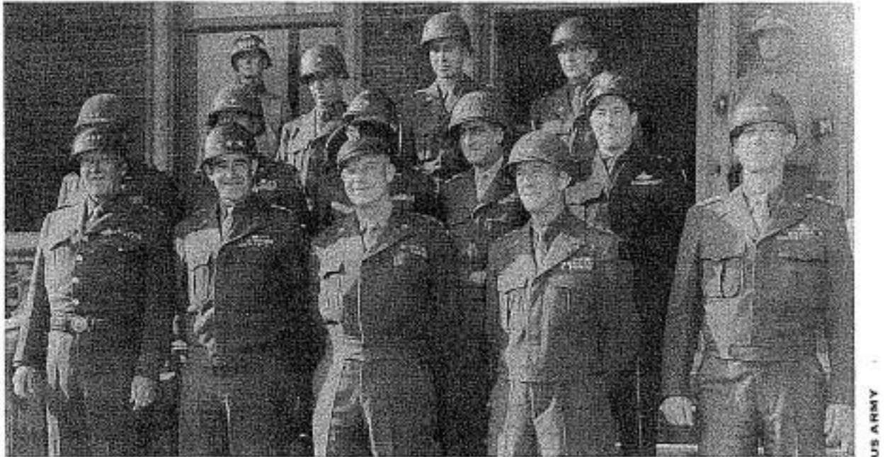
General Eisenhower (center) shown in Liege, France with Generals Patton, Bradley, Hodges, Simpson and others during World War II.

good idea in gamesmanship or deterrence or containment or whatever is the governing idea of the moment.