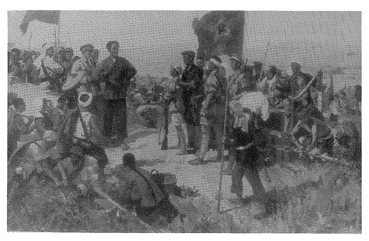
An artist's impression of the Long March titled "Comrade Mao Tse-tung at Wenchiashih."

political-military school in Pao-An had, by 1936, gained an enrollment of some 2,000. The school offered a variety of courses to officers, noncommissioned officers, communications specialists, etc. A vast program to eliminate illiteracy in the army was also begun because it is very difficult to assimilate the "glorious thought of Comrad Mao Tse-tung" if one cannot read or write. Meanwhile, Chu Teh and the remainder of the Red forces on the Long March arrived in the base area, swelling the Red Army to about 94,000.10