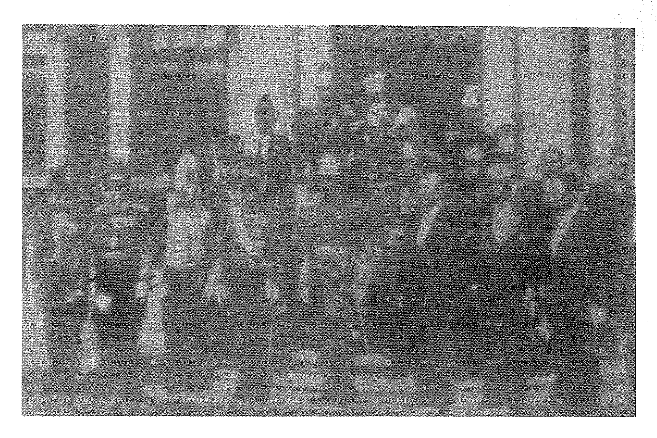
The inauguration of the Japanese Ambassador to the puppet Manchukuo.

enthusiasm for communism from the peasants.<sup>26</sup>