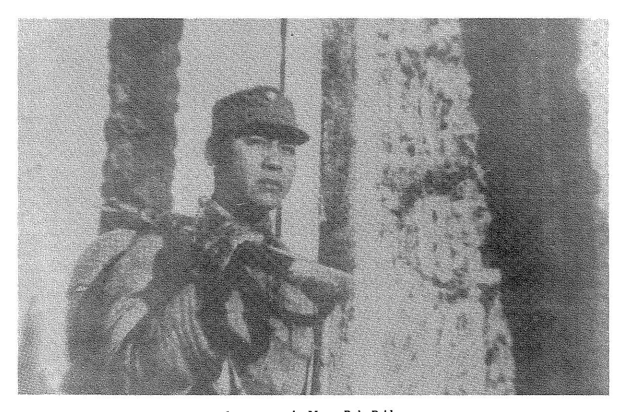
A sentry on the Marco Polo Bridge.

The Communist Eighth Route Army, commanded by Chu Teh, was supposedly, 45,000 strong, but some estimates put it between 80,000 and 90,000.<sup>14</sup> The Eighth