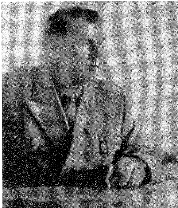
Marshal Ivan I. Yakubovsky

aggressive purposes; the Warsaw Pact for self-defense, sparked particularly by the entry of West Germany into NATO in 1955.