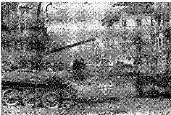
Budapest, November 1956.

Such was the case in 1956-58 when the resolve of the socialist countries to defend the peace halted the aggression against Egypt, Syria and Iraq. In 1956, the Soviet Union rendered fraternal assistance to the Hungarian people in putting down the counterrevolutionary uprising that was launched by internal reactionary forces with the direct participation of the West. In 1961, an imperialist provocation against the GDR was averted and in the following year support was rendered to revolutionary Cuba. In 1967, the fraternal socialist countries resolutely supported the Arab nations that were subjected to Israeli aggression. The assistance rendered in 1968 by five socialist countries to the fraternal people of Czechoslovakia in