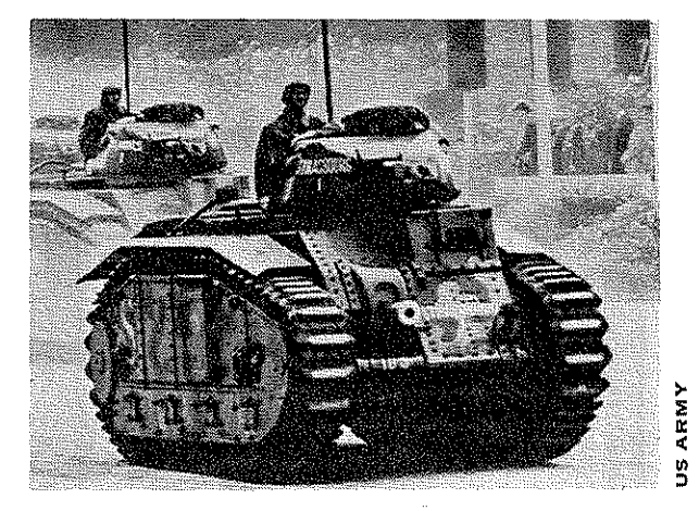
French B-1 Tank.

As for mechanized forces, De Gaulle's professional army would consist primarily of