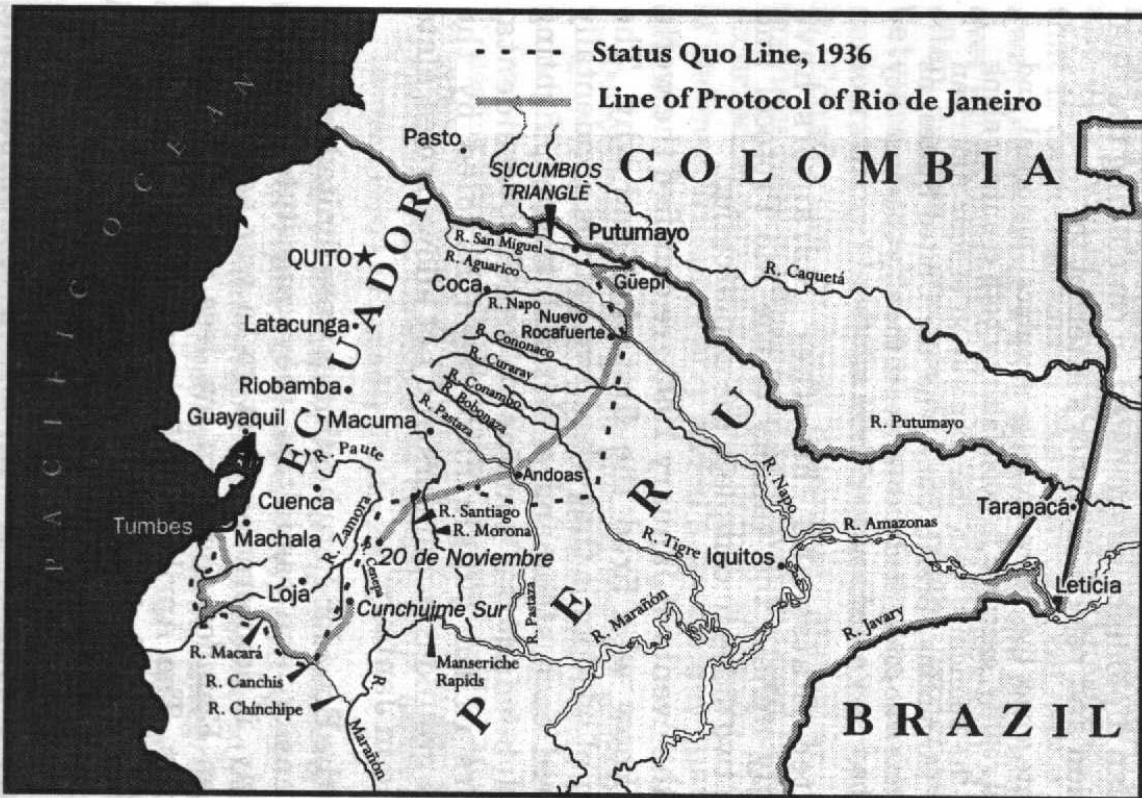
Map 3. The Status Quo Line of 1936 and the Rio Protocol Line of 1942.

Adapted from Bruce Wood, The United States and Latin American Wars, 1932-1942 , New York: Columbia University Press, 1966, Appendix.