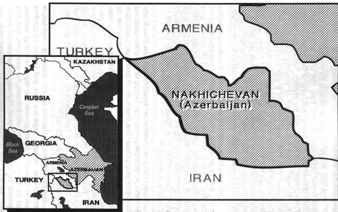
Figure 2. Transcaucasia.

Cetin proposed, with U.S. support, that should a cease-fire occur and negotiations begin, the postwar settlement should create a pure Armenian state out of Armenia and Nagorno-Karabakh and a continuous, purely Muslim, Turkic, state of Azerbaijan incorporating the formerly detached area of Nakhichevan. (See Figure 2.) This territorial exchange would allow construction of a pipeline whose path conformed to Turkey's objectives. 13