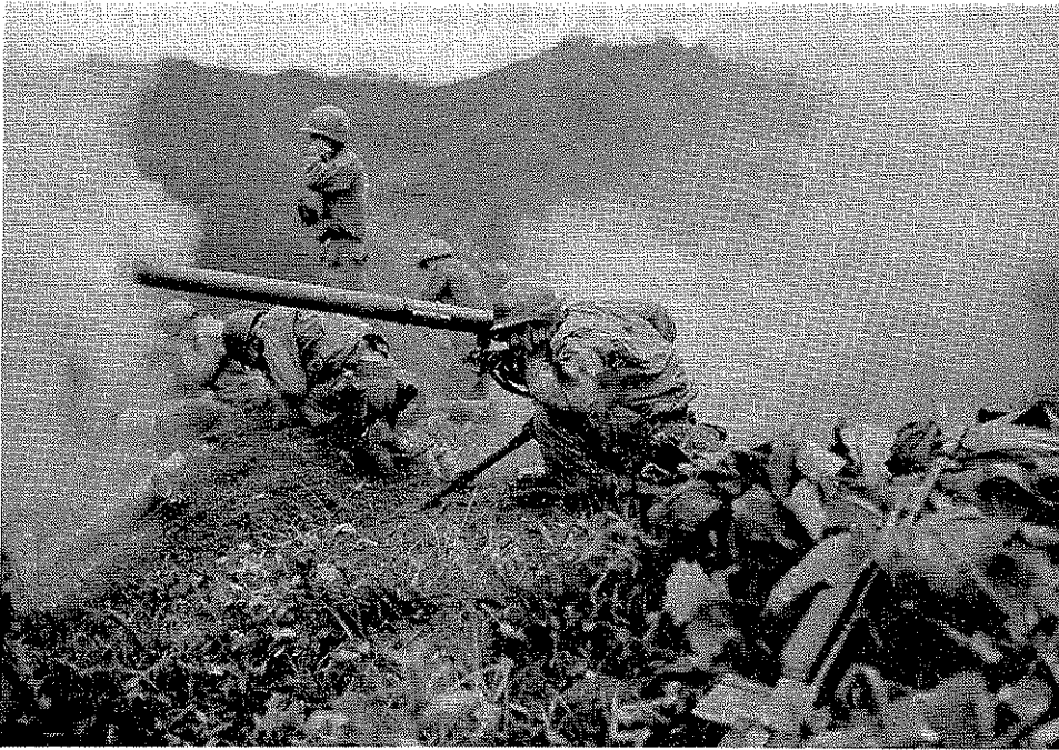
The operational coup at Inchon on 16 September 1950 reversed the tide of the war. Here, US 7th Division forces during the UN advance of 20 May to 24 June 1951.

“A higher commander,” Field Marshal Slim wrote, “must think ‘big.’” 29 Slim’s advice is particularly true at the operational level of war, for at this level the commander must deal, however derivatively, with strategic goals that require him to focus on broad but decisive operational objectives extended over time and space beyond the tactical realm. These objectives can range anywhere from destruction of committed forces or reserves to co-opting allies to even more abstract goals such as eroding the enemy’s public support. Neither Dien Bien Phu (1953) nor Tet (1968), for instance, was militarily crippling to the French and American armies, respectively; yet these events struck decisively at the popular and political support of both wars.