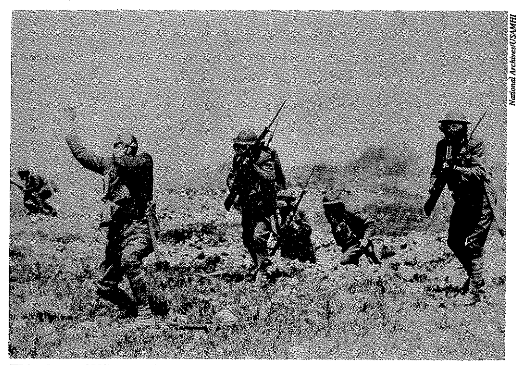
This photo of US troops in a training area in France during World War I was posed to illustrate the effects of phosgene.

have proven quite effective.<sup>42</sup> They cause minimal property damage and can reach the occupants of even heavily fortified structures.<sup>43</sup> Their utility has been reinforced by the advent of nerve agents that are highly suited to mobile warfare.<sup>44</sup> With nuclear capability beyond the reach of many nations, chemical weapons have become the "poor man's atomic bomb."<sup>45</sup> They are relatively cheap, easy to produce, and provide a significant multiplier of combat power. When coupled with a ballistic missile, chemical agents also present a potent strategic threat. (Consider, for example, the Chinese CSS2 missile. Widely marketed in the Middle East, it has a range of 1500 miles and can easily accommodate a chemical warhead.)<sup>46</sup> Even among nuclear powers today, chemical munitions are sometimes viewed as another available step in escalation before resort to nuclear weaponry.<sup>47</sup>