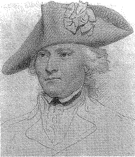
Major General Arthur St. Clair