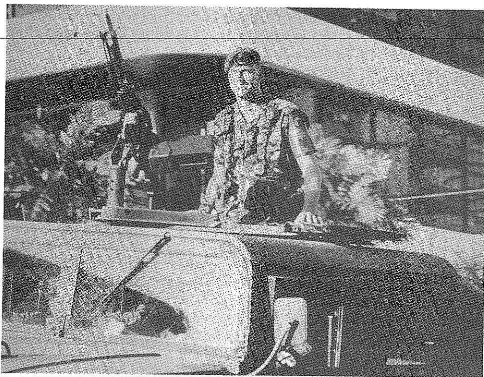
XVIII Airborne Corps

MPs proved again during Operation Just Cause that they are well-suited to fill a variety of roles in contingency operations.