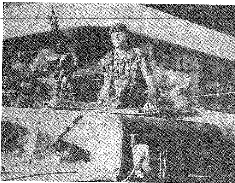
XVIII Airborne Corps

MPs proved again during Operation Just Cause that they are well-suited to fill a variety of roles in contingency operations.