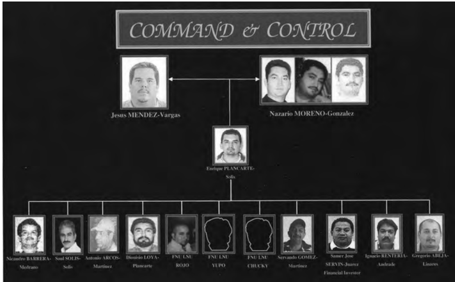
Figure 2. Structure of La Familia Michoacana.

Figure 2 indicates the key members of La Familia. Appendix 2 furnishes a more expansive list of present and former leaders, specialized operators, and notable apparatchiks.