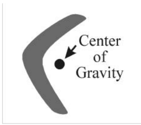
Figure 2. Center of Gravity of a Boomerang.

Calculating a CoG for a simple, symmetrical object—a ruler, a rock, a boomerang—is not difficult. The CoG for a ruler is in the middle of it. The CoG for a sphere lies at its geometric center. Interestingly, the CoG for a boomerang, though not difficult to calculate, does not lie on the object itself, but in the space between the “V” (See Figure 2). 22 On the other hand, calculating the CoG for complex objects—such as a bolos or a human being with multiple moving parts—is more difficult. Such objects must be artificially “frozen” in time and space. When a complex object changes the distribution of its weight, its body position, or if external weight is added, the CoG requires recalculation (See Figures 3 and 4).